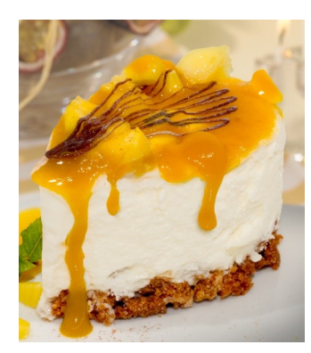
MANGO PASSION CHEESECAKE A fusion of cheesecake & ice cream sat on (gluten free) crunch base, topped with mango pieces & a mango and passionfruit sauce

Vegan Lotus Biscoff 'cheesecake' is the ultimate indulgent treat for all occasions. Creamy cheesecake filling sandwiched between a buttery biscuit base and a deliciously warm Biscoff topping.